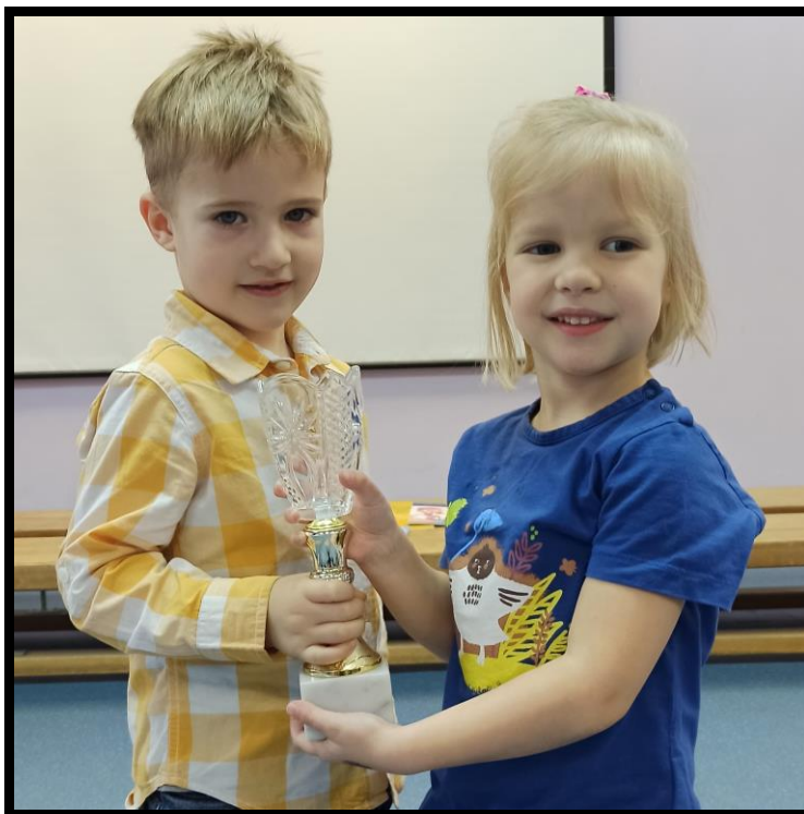
House of the Week - Kandinsky

Well done to everyone for their good efforts this week.