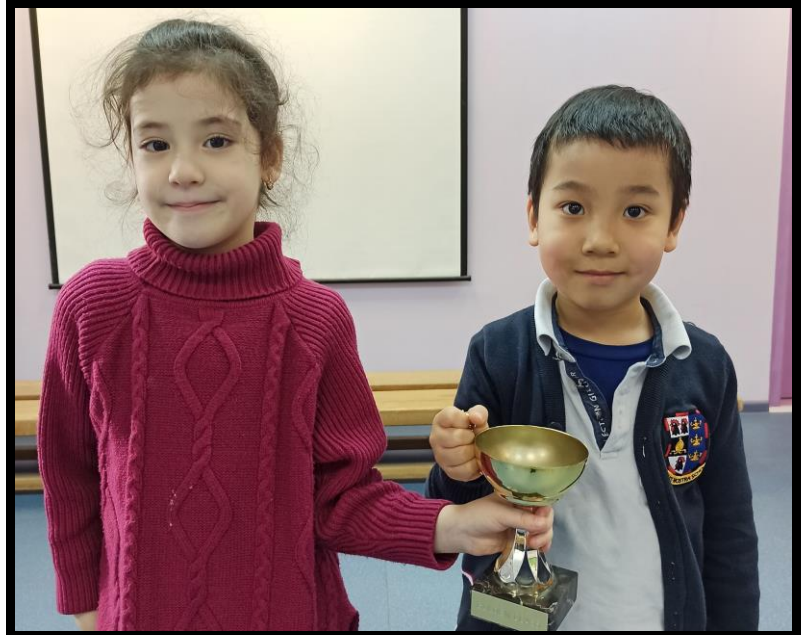
Attendance Cup Winners – Y1 DS with 95%