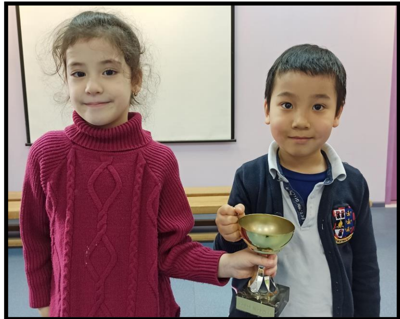
Attendance Cup Winners – Y1 DS with 95%