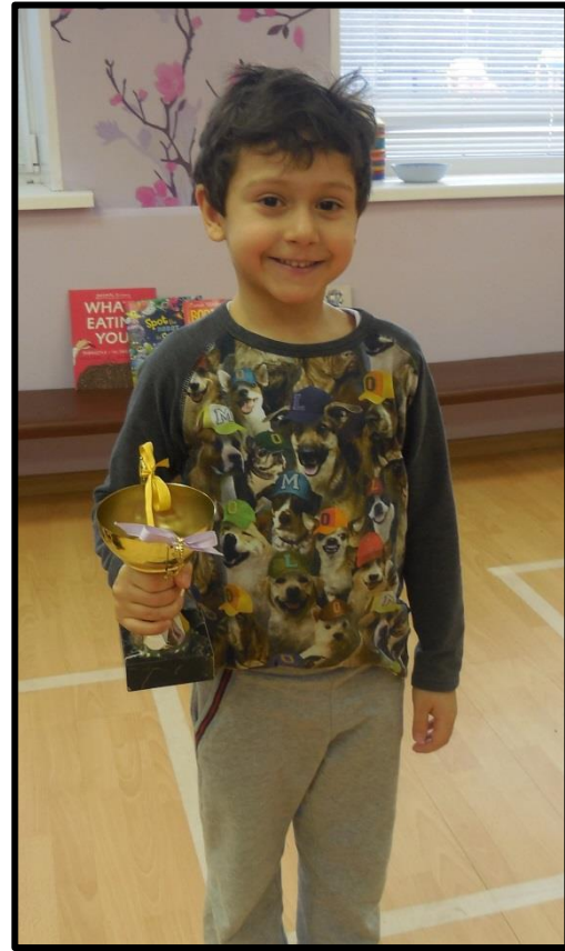
Class Attendance Cup Winners – Yr. 1AK – 98.5%